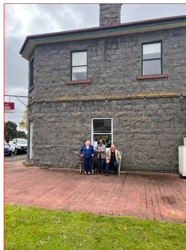
Ararat—shopping & café lunch